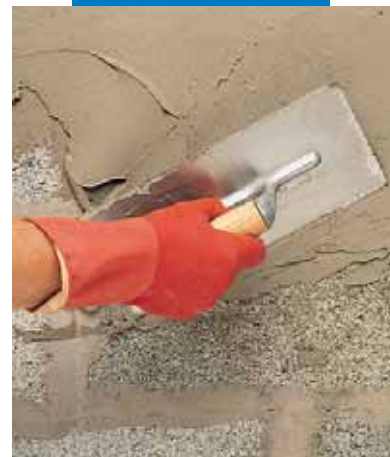
Application of Idrosilex Pronto by trowel