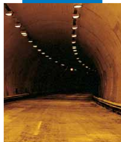
Application of white Idrosilex Pronto by spray gun in highway tunnel