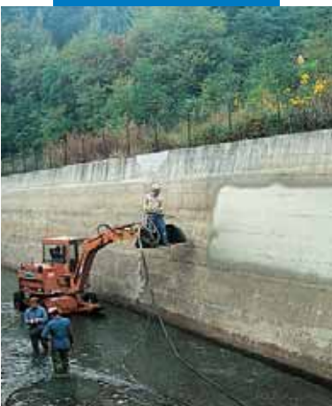
Application of Idrosilex Pronto by spray gun in hydroelectric canal