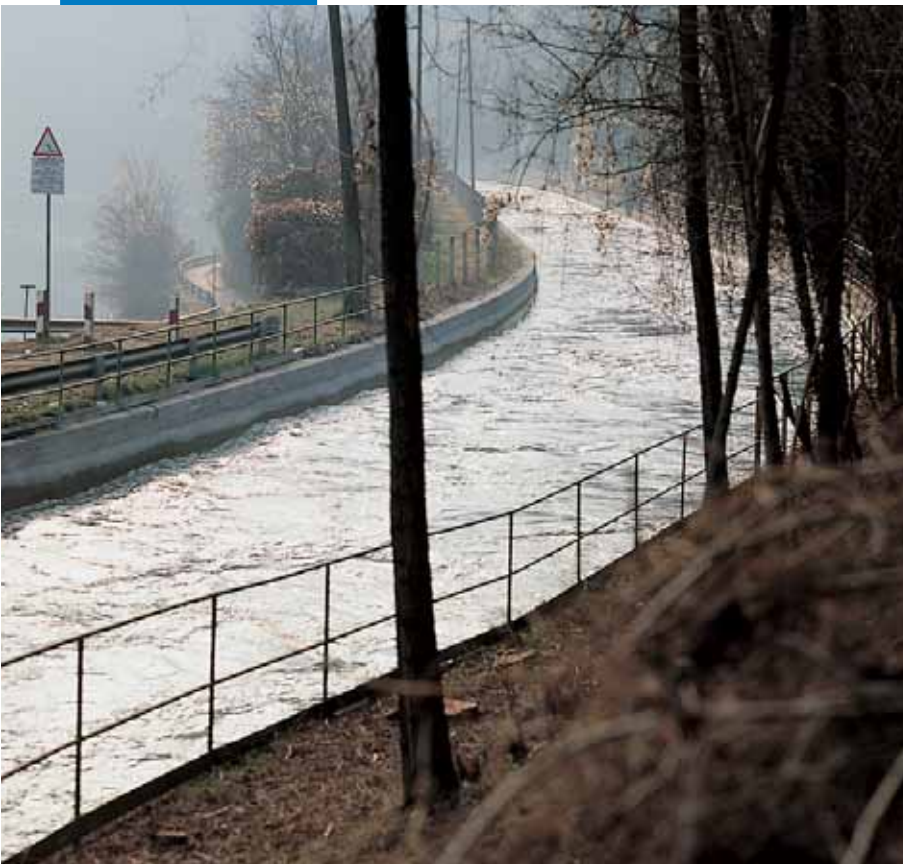
Bertini hydroelectric canal - Como - Italy. Surfaces treated with Idrosilex Pronto

Please refer to the current version of the Technical Data Sheet, available from our web site www.mapei.com