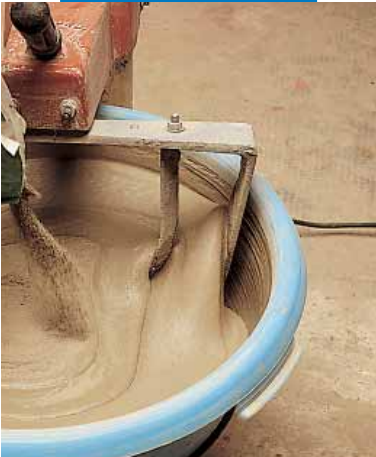
Grey Idrosilex Pronto mixed with water