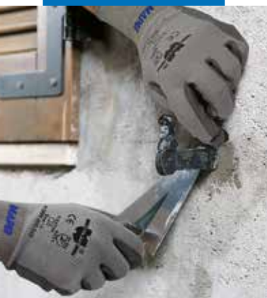
Fixing foundation bolts for windows using Lampocem

Cavities formed for fixing must be roughened and thoroughly soaked with water.