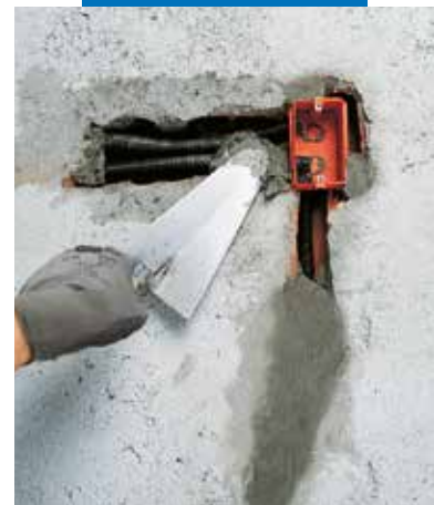
Fixing enclosures and electric cable tubes using Lampocem