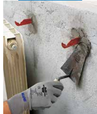
Fixing anchor bolts for radiators using Lampocem