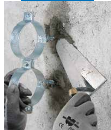
Fixing brackets for pipes using Lampocem