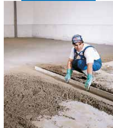
Preparing a levelling strip

Please refer to the current version of the Technical Data Sheet, available from our website www.mapei.com