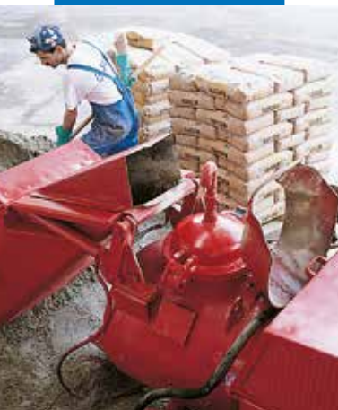
Mixing Topcem with an automatic pumping unit