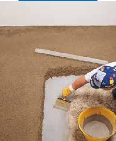
Spreading the anchoring slurry for bonded Topcem screeds