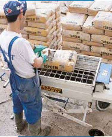
Mixing Topcem in a mini-batcher