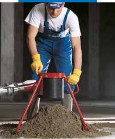
Batching a Topcem mix