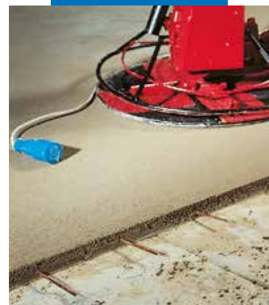
Power floating the surface of a Topcem screed