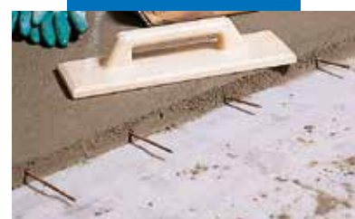
Detail of a Topcem screed with reinforcement rods