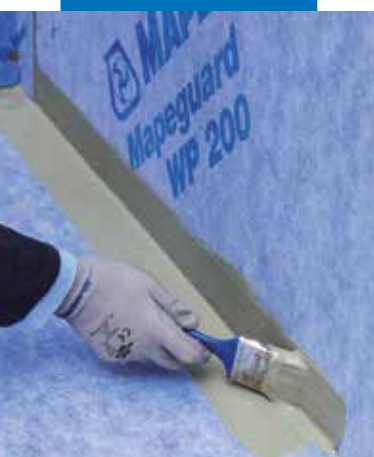
Application of the Mapeguard WP Adhesive in order to seal the joints in the corner before the application of Mapeguard ST