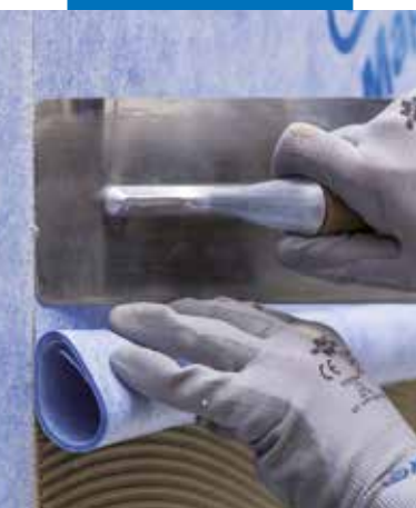
Application of the second sheet