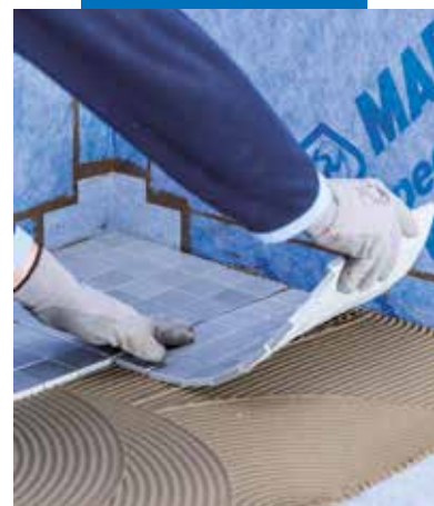
Laying of the tiles