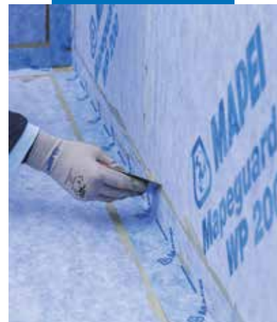
Application of Mapeguard ST

All relevant references for the product are available upon request and from www.mapei.com