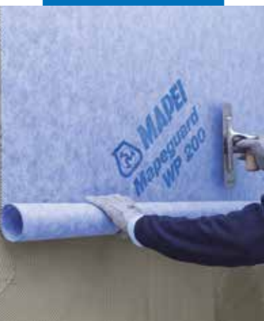
Laying Mapeguard WP 200