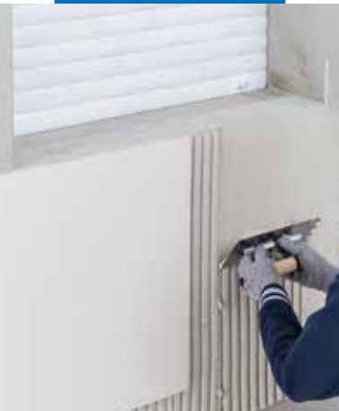
Installation of large-size ceramic tiles