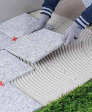
Installation of natural stone in exterior