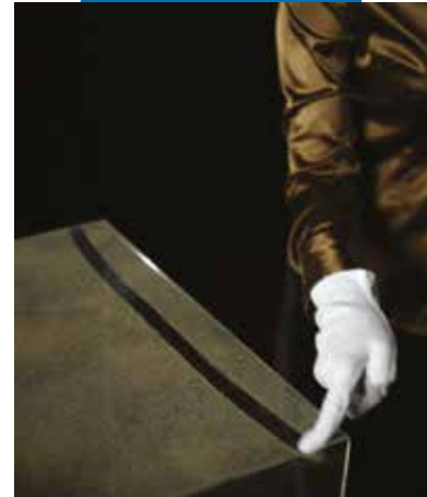
With a traditional cementitious product