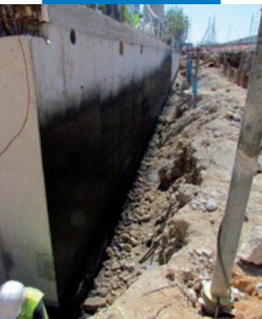
Foundation wall waterproofed with Plastimul 2K Reactive