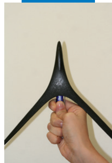
Empirical test of Plastimul 2K Reactive's high flexibility and resistance to punch loads