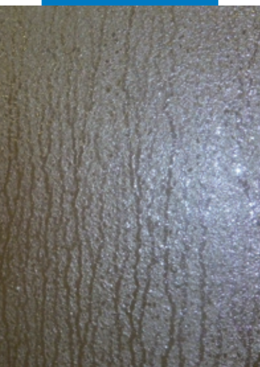
Normal bleeding on the surface of the product immediately after application

least 1% so that water can run off towards the sides or towards drainage points. Remove cement laitance, loose and crumbling parts and all traces of dust, grease, oil and form-release compounds. Before applying Plastimul 2K Reactive on masonry (bricks, vibro-compressed concrete blocks, etc.), make sure the surface is sufficiently even. Carefully remove from the surface all traces of mortar protruding from between the bricks or blocks and fill any gaps in the joints with Mapegrout Fast-Set rapid-hardening, fibre-reinforced cementitious mortar, Mapegrout Thixotropic shrinkage-compensated, fibre-reinforced mortar or Mapegrout T60 if sulphate-resistant mortar is required. As an alternative, use sand/cement mortar admixed with Planicrete latex rubber for cementitious mixes. Concrete surfaces, on the other hand, must have no uneven areas or gravel clusters. Repair or smooth over any rough areas with the same products from the Mapegrout line mentioned above. Round off all sharp edges on horizontal and vertical surfaces with suitable power tools and blend in the areas between foundations and vertical walls by forming a fillet joint made from the Mapegrout product chosen. Seal any breaks in correspondence with structural joints with Mapeband TPE bonded to the substrate with Adesilex PG4 . For further details or particular waterproofing requirements please contact MAPEI Technical Services Department.