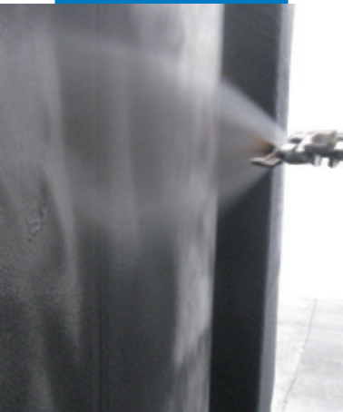
Application of Plastimul 2K Reactive