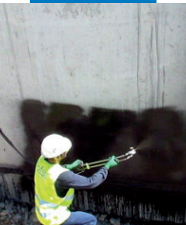
Application of Plastimul 2K Reactive